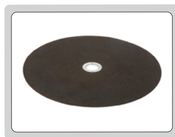
aluminum oxide sanding disc(included)